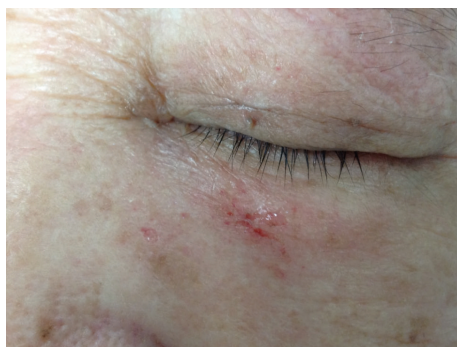
FIGURE 3: Example of skin denudation.

low levels of peel force are not always associated with low damage [21].