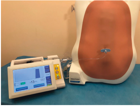
FIGURE 1: Experimental setting: the CompuFlo® and the epidural simulator used.

(CompuFlo® epidural computer-controlled anesthesia system instrument, Milestone Scientific, Inc., Livingston, New Jersey, USA) has been recently introduced and has been demonstrated to be objective, precise, reliable, and highly sensitive in clinical practice [10–12].