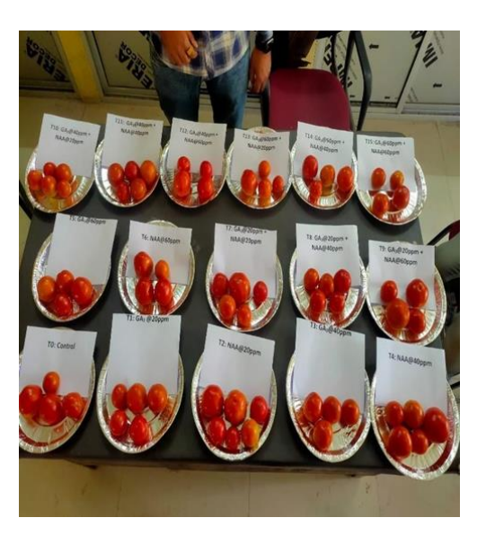
Fig. 2. Production scenario

Days to 1<sup>st</sup> Flowering of plant significantly varied among different treatment combinations.The minimum days to 1<sup>st</sup> flowering (25.54) were