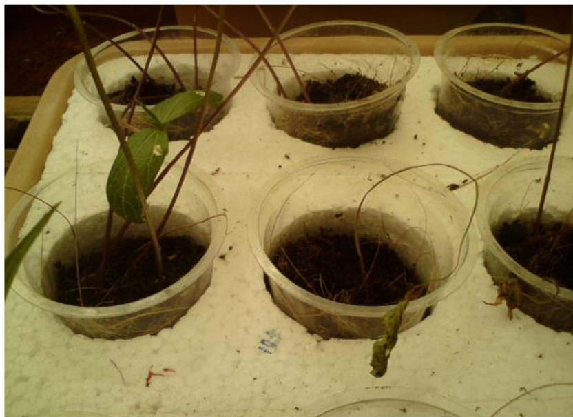
Fig. 3. Response of the susceptible blackgram seedlings (RU-8-708) to salinity

range for this trait was from 0.0011 g to 0.0285 g (G10) in T 1 , 0.0050 g to 0.0495 g (G18) in T 2 and 0.0200g to 0.0626 g (G61) in T 3 . It was found that the genotype G 18 (0.0495 g) had significantly higher values than the general mean in T 2 . Genotypes viz., G 24, G 61 and G 70 had significantly higher values than the general mean in T 3 . Dry weight of the shoot decreased to 97.22% of the control respectively (Table 4). The shoot dry weight showed decreased with increasing salinity compared to control observed by El Sabagh et al. [22] Hasan et al. [24] and Subroto Kumar Podder et al. [25].