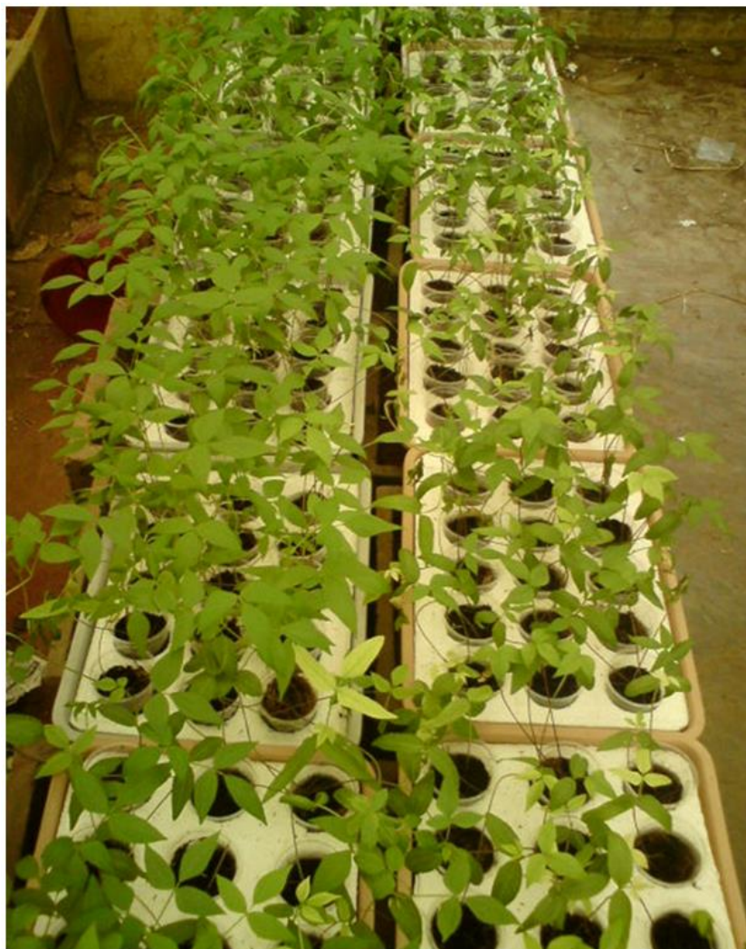
Fig. 2. Response of blackgram seedlings to T_3 and T_2 on 18 DAS