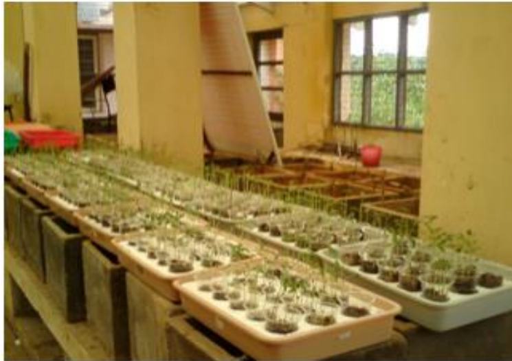
Fig. 1. Overview of the blackgram seedlings on 6 DAS