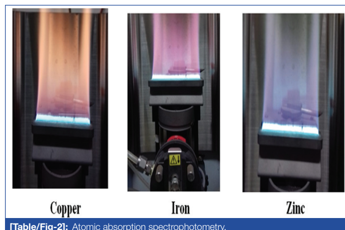
[Table/Fig-2]: Atomic absorption spectrophotometry.

For the serum preparation 5 mL venous blood was collected and stored at 37° C for one hour followed by centrifugation at 3000 rpm for six minutes. Separated serum was stored in a plain sterile glass bulb at 4°C and estimation of trace elements Cu, Zn and Fe was done by atomic absorption spectrophotometry [Table/Fig-2].