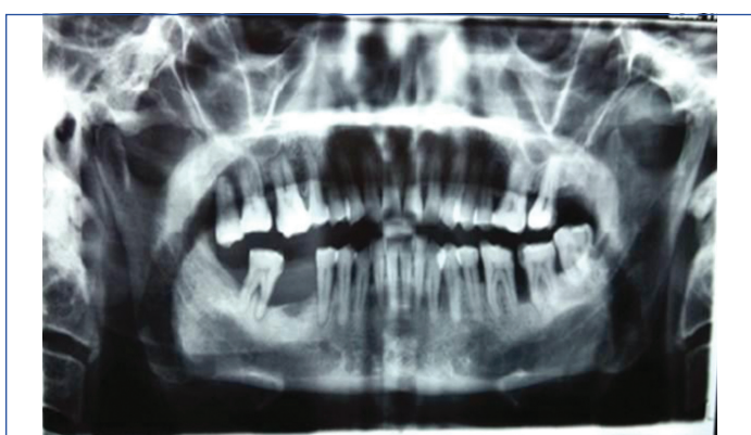
[Table/Fig-2]: Orthopantomogram of a patient with periodontitis and carcinoma of the mandibular left alveolar region.

Exclusion criteria: Patients with immunodeficiency congenital anomalies, trauma, and any accident that involves the periodontium, edentulous patients, patients with a history of organ transplant, amyloidosis, HIV infection, autoimmune disorders, those with any other systemic conditions like diabetes, hypertension etc., pregnant and lactating mothers and those patients with a history of antibiotics and steroids medication within last one month, were excluded in the study.