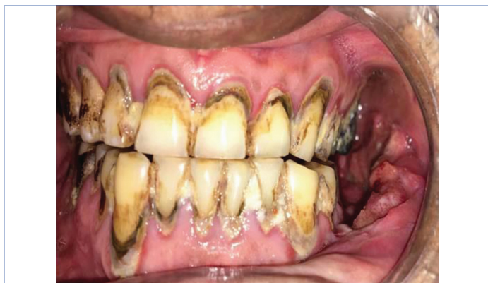
[Table/Fig-1]: Carcinoma of the mandibular left alveolar region.

Inclusion criteria: Patients with age greater than 21 years, diagnosed with squamous cell carcinoma affecting alveoli and gingiva. [Table/Fig-1,2] along with radiographic appearance of chronic periodontitis i.e. bone loss [Table/Fig-2] and no history of periodontal therapy done in last three months, were included in the study.