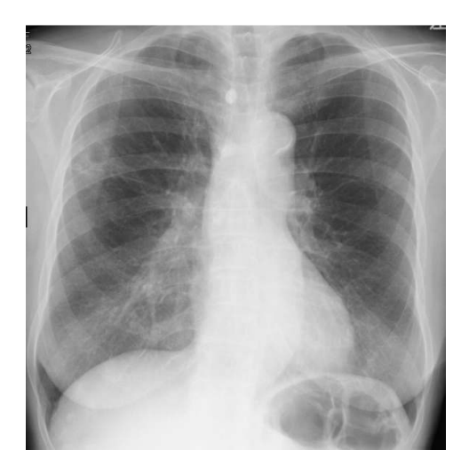
Fig. 3A. Radiography of the chest The cystic lesion like a cavity was observed in right upper lobe of lung