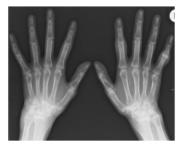
Fig. 1. Radiography of the bilateral hands There is a joint space narrowing between the distal end of the radius and the proximal row of carpal bones, the proximal ends of the metacarpals and the distal row carpal bones, and among each carpal bone. The left hand is more remarkable than the right hand in these findings

[10,11]; a representative kampo formula for RA treatment.