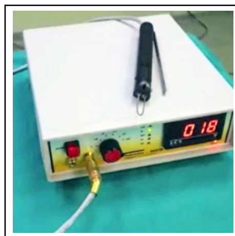
Fig. 1: Thermocautery device.

Surgeon 1 used thermocautery in all of the circumcisions he performed, while surgeon 2 used either the surgical circumcision or Alisklamp technique. The choice of technique depended entirely on the experience of the individual