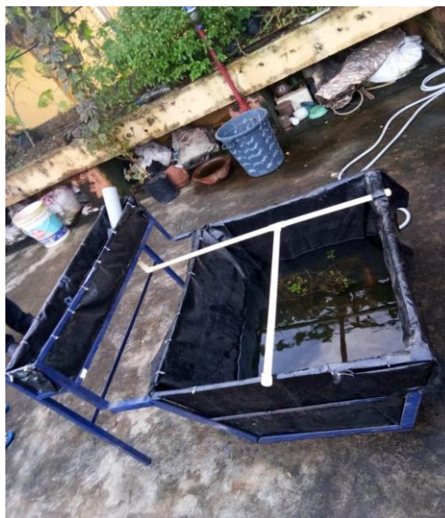
Fig. 7. Preparing nutrient solution media using cow urine for rooftop garden

Nutrient solution is delivered to the containers by supplying lines of black polyethylene tubing to spaghetti tubing spray or ring dippers in the containers, application devices have different wetting's patterns and are available at different flow rates. The choice of application system is important in order to provide proper wetting of the medium at each irrigation. Texture and porosity of the growing medium and the surface area to be wetted are important considerations in making the choice.Ref.[10] Tubing provides a point-source wetting that might be appropriate for a fine-textured type of medium and allows water to be conducted alterably with ease. In lay flat bags ,single spaghetti tubes at individual plant holes will provide good wetting of peat-lit media .In a vertical bag containing porous medium, a spray stick with a 90-degree spray pattern will do a good job of irrigation if it is located where we get the majority of the surface. Ring dippers are also a good choice for vertical bags although somewhat more expensive .when choosing an application system for bag container uniformly so that the objective of irrigation is to distribute internet solution uniformly so that the anterior medium is wet. Since root systems cannot function in a dry medium [Fig-7].