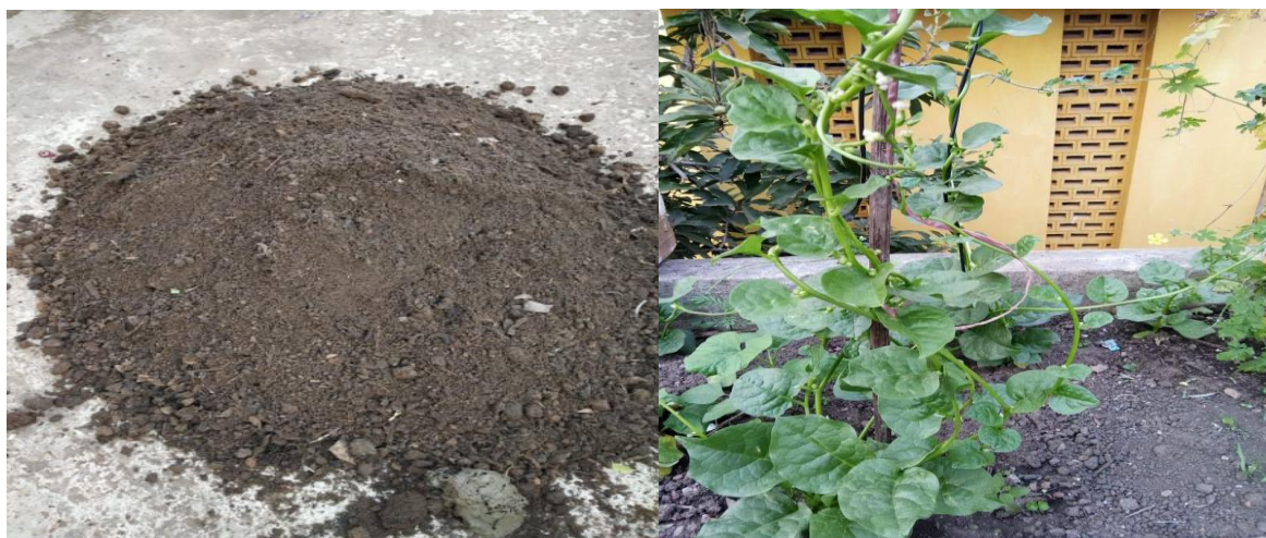
Fig. 2. Mixture of bio-compost to produce growing solid media use in rooftop farming