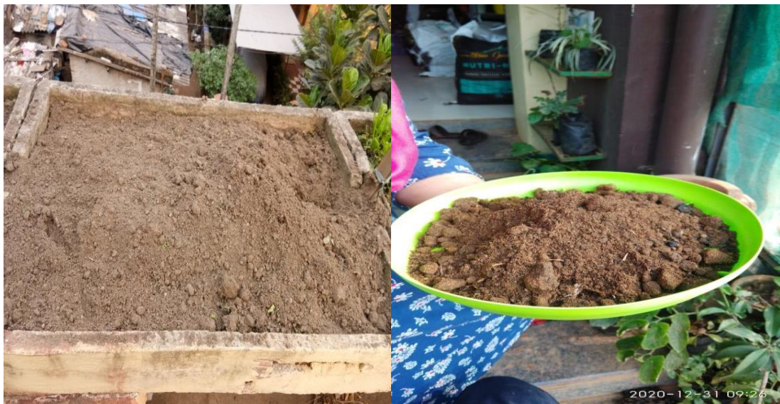
Fig. 4. ARKA fermented coco peat use in rooftop garden.