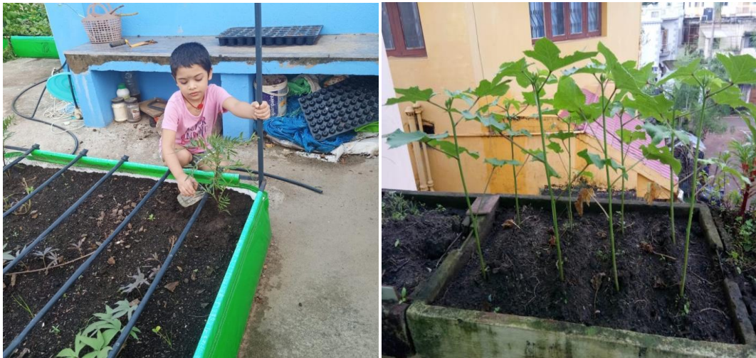
Fig. 5. Vermiculite use in rooftop garden in bhubaneswar