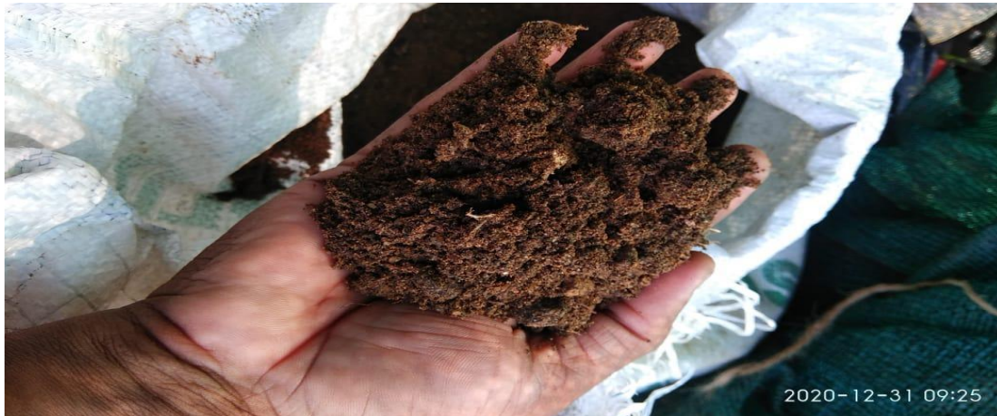
Fig. 6. Peat contains rockwool from Bhubaneswar