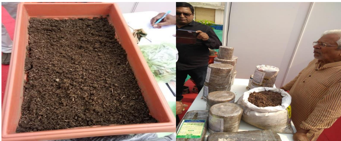
Fig. 1. Use Peat Moss in Rooftop Garden in Bhubaneswar