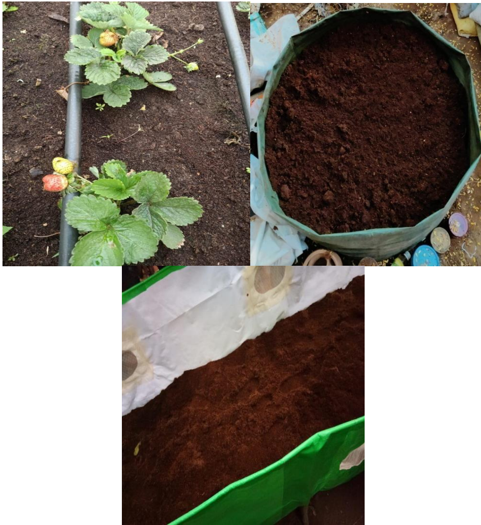
Fig. 3. Coco peat use in rooftop garden in Bhubaneswar