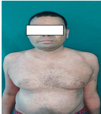
Fig. 2. Showing buffalo hump and swelling of face (cushinoid features)