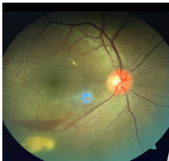
Fig. 1. Posterior segment of right eye showing vitritis, subhyaloid bleed inferior to fovea, patch of retinochoroiditis about 1DD along inferior arcade with exudates at macula and early macular star were noted in right eye

Patient was advised to get TORCH workup, Venereal disease research laboratory test, Rapid plasma reagin test, Erythrocyte sedimentation rate, Complete blood count, HIV, HbsAg, HCV, Chest Xray and Mantoux test. The labs showed reactive Toxoplasma IgG and IgM, CMV IgG reactive and HSV 1 and 2 IgG positive. Patient was referred to the physician for further management of underlying etiological conditions. Patient was started on oral Valgancyclovir 500mg for 15 days. Regular follow up was advised and retinal pathology was observed with nil ophthalmologic intervention.