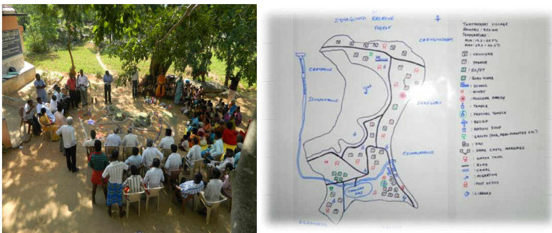
Fig. 2. Farmers-subject matter specialists interaction meeting and social map of Thattaparai village

The identified climate impacted and natural resources management related problems were classified into research and extension problems to make more in focus of the farmers to adopt effective climate smart in interventions in the Thattaparai village in Gudiyatham block of Vellore district of Tamilnadu as a model climate smart village through effective people participation in the semiarid tropics' farming systems of southern India.