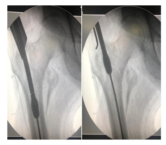
Fig. 2. The serial reaming of the medullary cavity over a guide wire using standard flexible reamers