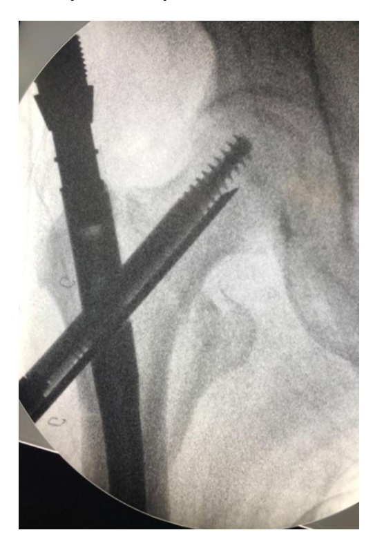
Fig. 4. The positioning of the proximal screws in superior segment of the head and neck

Fig. 3. The guide wire was pushed medially using a retractor, while reaming, to make more space on the medial aspect of the proximal femur to accommodate the nail