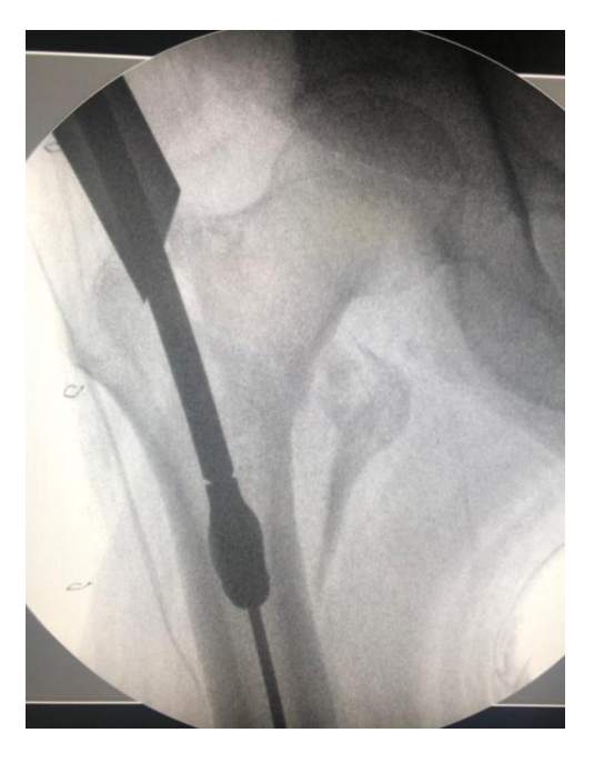
Fig. 3. The guide wire was pushed medially using a retractor, while reaming, to make more space on the medial aspect of the proximal femur to accommodate the nail

the femoral head and neck fragment considering the anti-version of the proximal fragment.