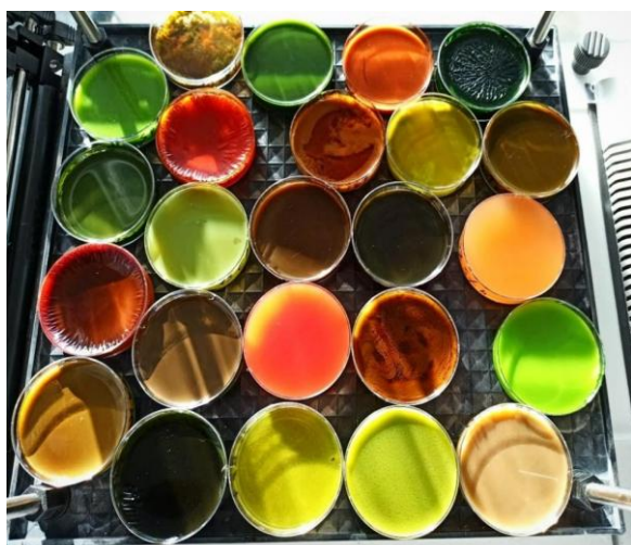
Fig. 1. Drying process of aqueous plant extracts using open petri dishes in an incubator shaker at 40°C