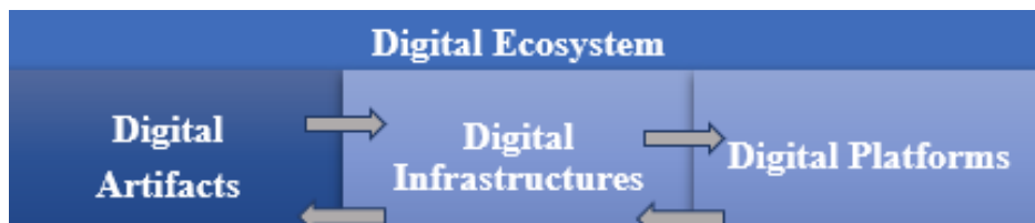
Fig. 2. Formation of digital ecosystem

communications, content, and human networking, resulting in the so-called fourth industrial revolution [9] and digital transformation [10]. Mobile services, social media, cloud computing, the Internet of things, big data, and robotics have all supported novel approaches to collaborating, organizing resources, designing products, matching complex demand and offer, and developing new standards and solutions over the last few years. The competitive environment has been gravely altered as a result of such rapid development and it has reshaped traditional business strategies, models, and processes. In theory, a digital ecosystem is a self-organizing, scalable, and sustainable system composed of diverse digital entities and their interrelationships to increase system utility, cooperation, and innovation [11]. The concept of a digital ecosystem was defined as the result of three different but interrelated elements, namely digital artifacts, digital infrastructures, and digital platforms [12], as illustrated in Fig. 2.