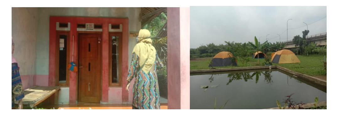
Fig. 3. Homestay and camping ground