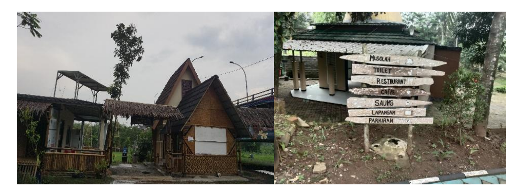
Fig. 5. Tourism Information Center (TIC) and signboard