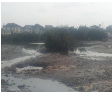
Plate 1. Station 1