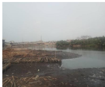
Plate 2. Station 2