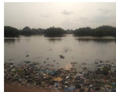
Plate 3. Station 3