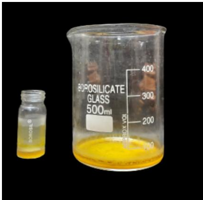
Fig. 1. Concrete obtained through solvent extraction