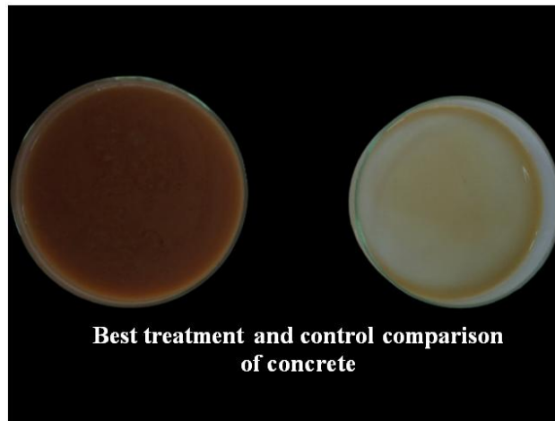
Fig. 3. Comparison of the concrete of the T1 and T6