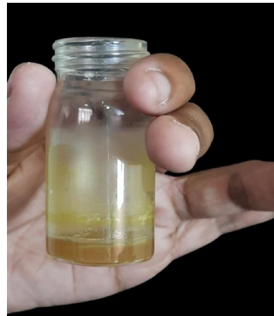
Fig. 2. Evaporation of hexane