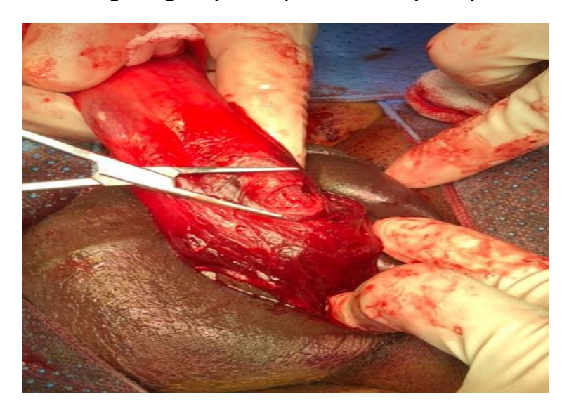
Fig. 2. Intra-operative late intervention with circumferential incision and degloving the penis

Case 2: A 32-year-old non-diabetic non-smoking patient presented to the emergency department 20 hours after the injury with associated complaints of pain and swelling in the penis and scrotum. The patient did not report any urinary complications. There was no significant past medical history. On physical examination, a big hematoma with suprapubic ecchymosis was observed in the penis and scrotum. On the basis of these findings, a diagnosis of penile fracture was made. The patient was immediately taken to the operating theater. After that, the patient was positioned laying in the supine position. A 14 fr Foley catheter was inserted. Spinal anesthesia was administered and, after preparation of the surgical field, surgery was performed. A circumferential incision proximal to the coronal sulcus was made which enabled complete degloving of the penis. During this procedure, a