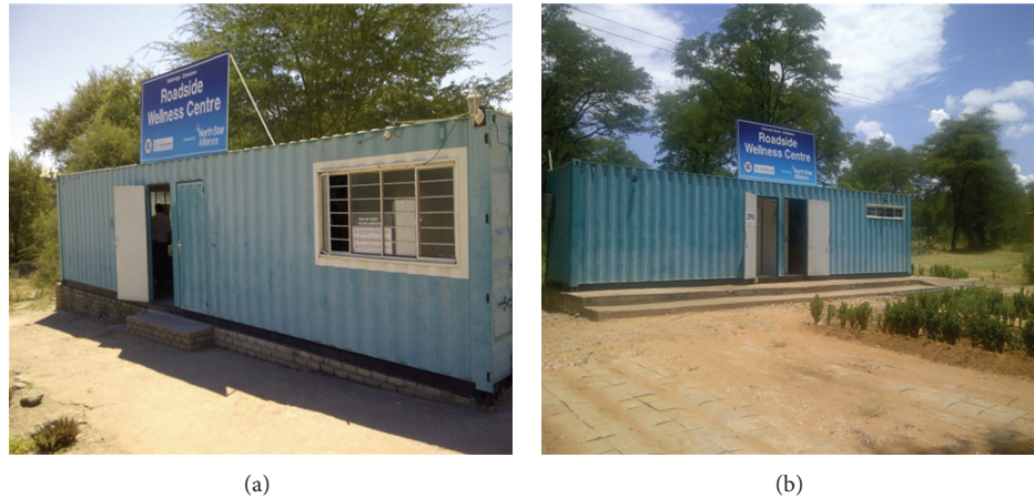
FIGURE 1: Roadside Wellness Centres in Chirundu South and Beitbridge, Zimbabwe.

a survey of truck drivers visiting sex workers at truck stops in KwaZulu Natal found an overall prevalence of 56% [13]; and, in 2011, HIV infection in long-distance truck drivers in the Niger Delta of Nigeria was estimated at 10% [4, 14]. A 2004 modelling study estimated new HIV infections at 3000–4000 annually among sex workers and their clients (mainly truck drivers) on the major transport corridor between the port of Mombasa, Kenya, and Kampala, Uganda [15–17]. This corresponded to a high incidence estimate between 0.66 and 0.89 per 100 person/years in truck driver clients of sex workers, assuming HIV prevalence in truck drivers to be 20%, condom use frequency to be constant (78% for contacts with sex workers), and HIV prevalence in sex workers to vary between 30% and 50%.