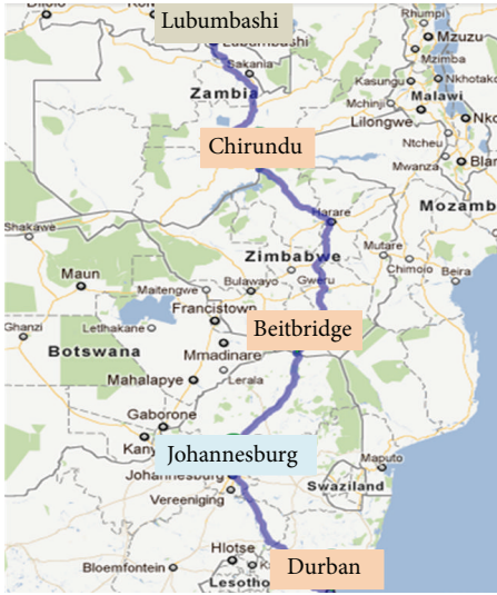
FIGURE 2: North-South corridor across South Africa, Zimbabwe, and Zambia.

HIV-uninfected partners when comparing treatment initiation at CD4 counts between 350 and 550 cells/ \mu\text{L} to a delayed start at CD4 counts below 250 cells/ \mu\text{L} [24]. Furthermore, in recently published documents, WHO has provided guidance on the implementation and evaluation of demonstration projects of preexposure prophylaxis and early initiation of treatment [25, 26]. Several conditions are prerequisites for effective engagement of patients across the spectrum of HIV care services [27, 28] for these new uses of antiretrovirals for prevention to realise their promise. First, HIV testing should be widely available to facilitate early identification of HIV-positive patients. The identified individuals should be willing and able to start ART at high CD4 counts. HIV-positive patients on ART should then be carefully monitored and supported to maintain high levels of adherence and achieve viral suppression, rendering them less infectious [29] and ultimately decreasing HIV transmission [27, 30, 31]. Mathematical models have assessed the promise of an early ART approach in the general population, with mixed results [32–37]: although similar reductions in incidence are estimated for the short term, long-term predictions vary significantly [38]. However, recent modelling including mobility and limited retention in care have shown that structural barriers to care could be an important limitation for these programmes [39].