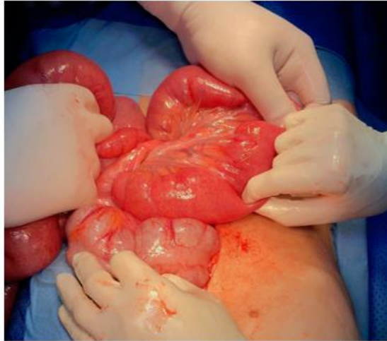
Fig. 3. Volvulus