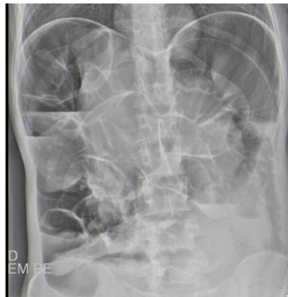
Fig. 1. Abdominal x-ray in orthostatism

A 32-year-old male patient came to the emergency department with diffuse, constant pain, of increasing intensity, for 6 days, without irradiation, worsening, or relieving factors. It had been associated with constipation and abdominal distension for the last 3 days. He denied fever, nausea, vomiting, and alterations in the genitourinary system. Objectively, the abdomen was distended with hydro-aeric sounds with a metallic tone, without signs of peritoneal irritation or identifiable hernias. A nasogastric tube was placed and 3500cc of stasis content drained immediately.