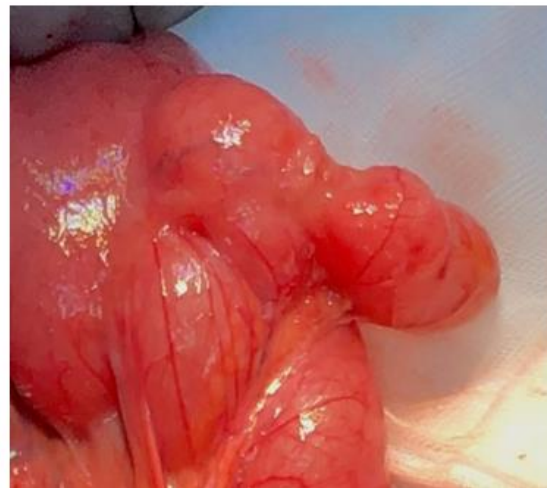
Fig. 4. Meckel's diverticulum

An analytical study revealed leukocytosis ( 14.83 \times 10^3/\mu\text{L} ), with neutrophilia (87%), elevated C-reactive protein (CRP) (10.03 mg/dL), and lactate dehydrogenase (305 U/L). He had acute renal failure with creatinine 7.16 mg/dL. Abdominal radiography showed distension of the small bowel and colon with hydro-aeric levels (Fig. 1). An abdominopelvic computed tomography scan (TC) with intravenous contrast was ordered that showed 'marked distension of the stomach and intestinal loops, compatible with a colon'. 'The possibility of pneumoperitoneum was suggested (Fig. 2).