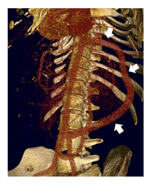
Fig. 3. Three dimensional volume rendering CT image shows aortoaortic dacron graft (arrows)

Pasaoglu et al.; BJMMR, 7(9): 789-794, 2015; Article no.BJMMR.2015.389