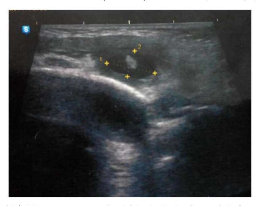
Fig. 1. High frequency sonography of right cheek showing cystic lesion with eccentric scolex diagnostic of cysticercosis

Human beings, both definitive and intermediate hosts, may accidentally or incidentally become the host of parasite in three ways: Faecal-oral infection, faecal-oral autoinfection and internal autoinfection. These eggs are partially digested in the stomach, evolve into oncospheres to penetrate the small intestinal mucosa and disseminate throughout the body eventually forming cyst [5]. An asymptomatic, isolated cyst may remain undetected, until it enlarges, migrates or dies and produces symptoms.