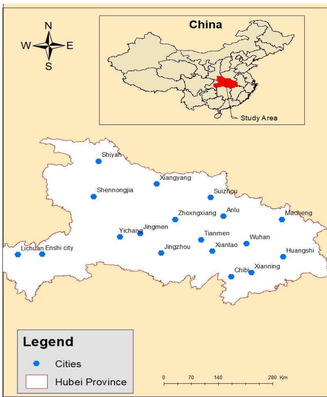
Fig. 2. Showing Hubei province of China