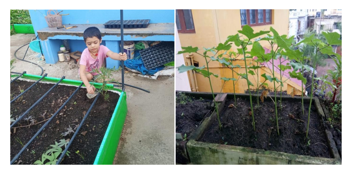
Fig. 5. Vermiculite use in rooftop garden in bhubaneswar