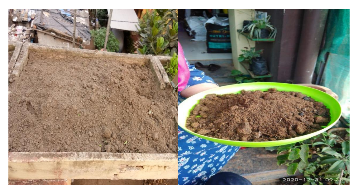
Fig. 4. ARKA fermented coco peat use in rooftop garden.