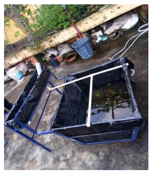
Fig. 7. Preparing nutrient solution media using cow urine for rooftop garden

Nutrient solution is delivered to the containers by supplying lines of black polyethylene tubing to spaghetti tubing spray or ring dippers in the containers, application devices have different wetting's patterns and are available at different flow rates. The choice of application system is important in order to provide proper wetting of the medium at each irrigation. Texture and porosity of the growing medium and the surface area to be wetted are important considerations in making the choice.Ref.[10] Tubing provides a point-source wetting that might be appropriate for a fine-textured type of medium and allows water to be conducted alterably with ease. In lay flat bags ,single spaghetti tubes at individual plant holes will provide good wetting of peat-lit media .In a vertical bag containing porous medium, a spray stick with a 90-degree spray pattern will do a good job of irrigation if it is located where we get the majority of the surface. Ring dippers are also a good choice for vertical bags although somewhat more expensive .when choosing an application system for bag container uniformly so that the objective of irrigation is to distribute internet solution uniformly so that the anterior medium is wet. Since root systems cannot function in a dry medium [Fig-7].