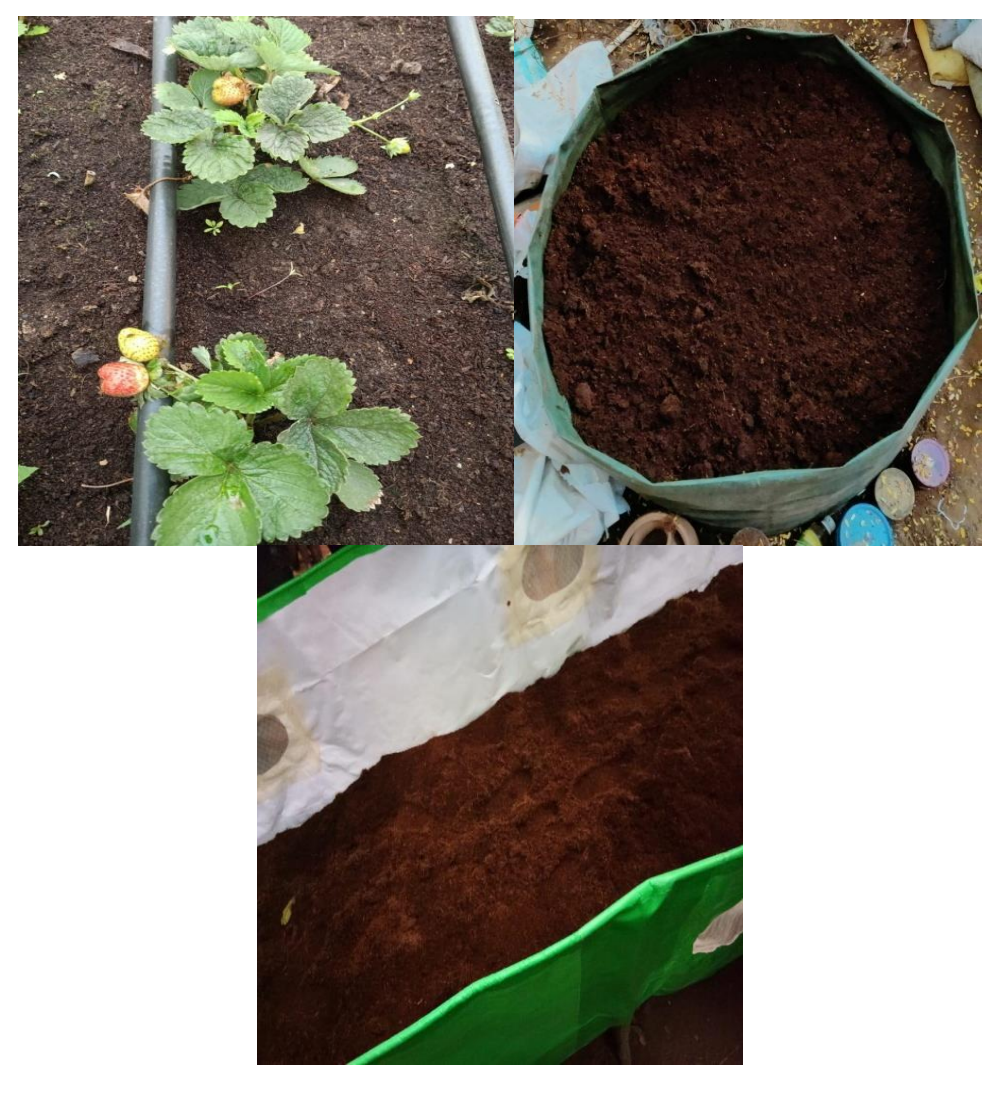
Fig. 3. Coco peat use in rooftop garden in Bhubaneswar