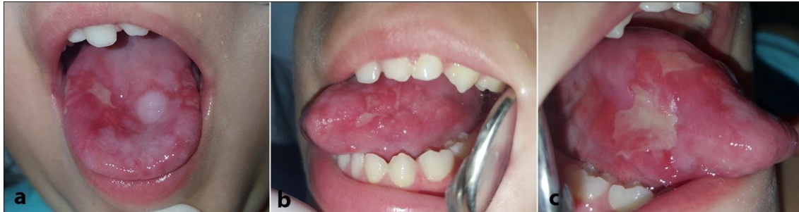
Fig. 1. Clinical examination; Diffuse erosions and ulcerations with peripheral atrophy and erythema and limited whitish papule-like and striated lesions, located: a) on the dorsum, b) left lateral border and c) right lateral border of the tongue

with topical corticosteroids of high potency (fluocinonide gel 0.05%), applied 3 times daily, for two weeks with re-evaluation and tapering upon improvement was administered; in addition, the parents were given oral hygiene and dietary instructions with avoidance of irritating foods. Close follow-up was also recommended.