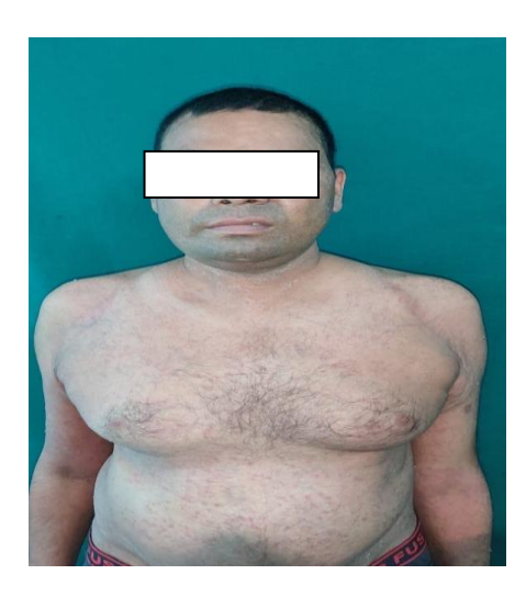
Fig. 2. Showing buffalo hump and swelling of face (cushinoid features)

Pandey et al.; AJRROP, 5(1): 36-39, 2022; Article no.AJRROP.83529