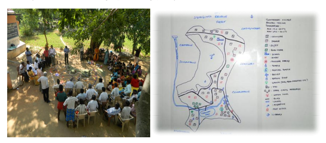
Fig. 2. Farmers-subject matter specialists interaction meeting and social map of Thattaparai village

The identified climate impacted and natural resources management related problems were classified into research and extension problems to make more in focus of the farmers to adopt effective climate smart in interventions in the Thattaparai village in Gudiyatham block of Vellore district of Tamilnadu as a model climate smart village through effective people participation in the semiarid tropics' farming systems of southern India.