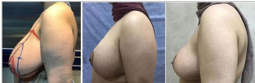
Figure 3. Preoperative, 1 month postoperative and 1 year postoperative pictures (lateral view) showing good esthetic outcomes with the nipples at the point of highest projection.