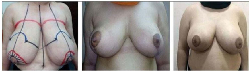
Figure 2. Preoperative, 1 month postoperative and 1 year postoperative pictures showing good esthetic outcomes with the nipples at the point of highest projection.